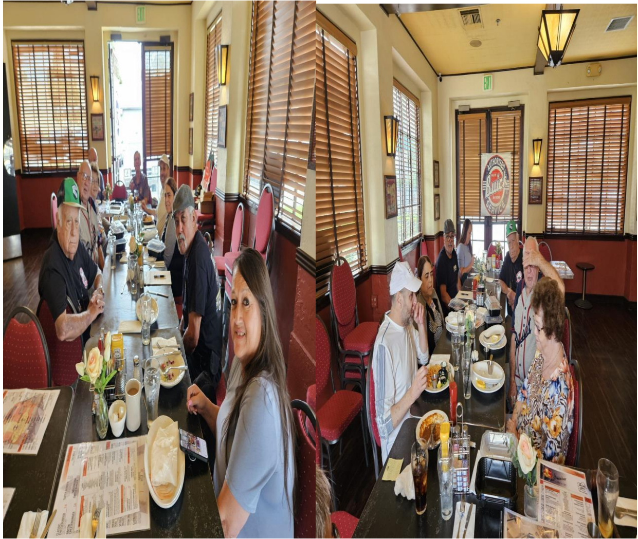
September Buick meeting attendees