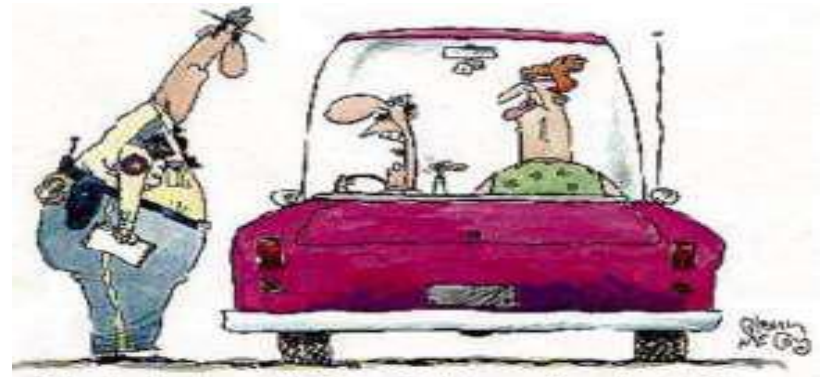
She's Doing All The Driving. I'm Just The One Behind The Wheel!

"You'll have to get behind me and push."