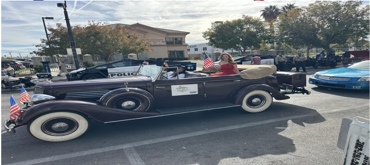
Lake Las Vegas Sports Club charity event: St. Jude's Ranch for Children